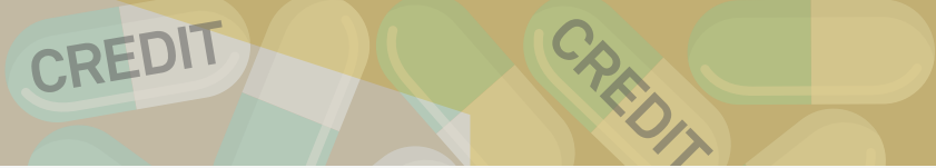
Chinese finance leverage (as % of GDP) is starting to ease...